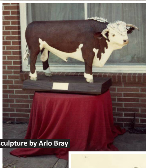
Sculpture by Arlo Bray